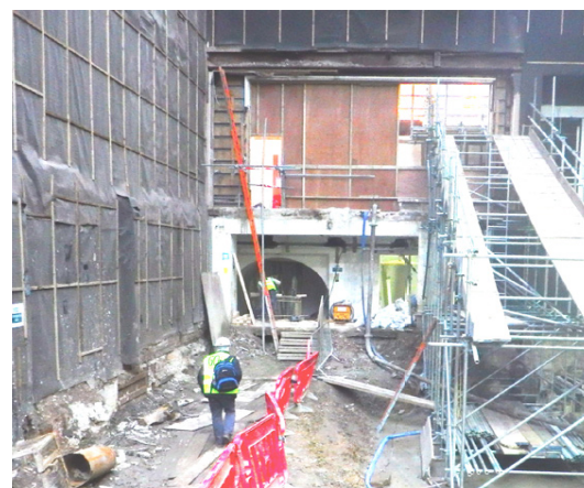
Below ground level at construction stage on the Christian Dior project site