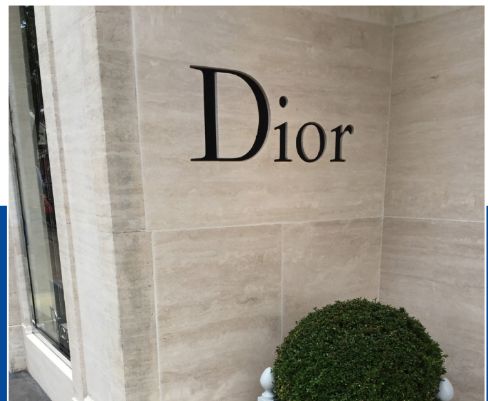
The installation is guaranteed by NSBC Advanced Preservations.