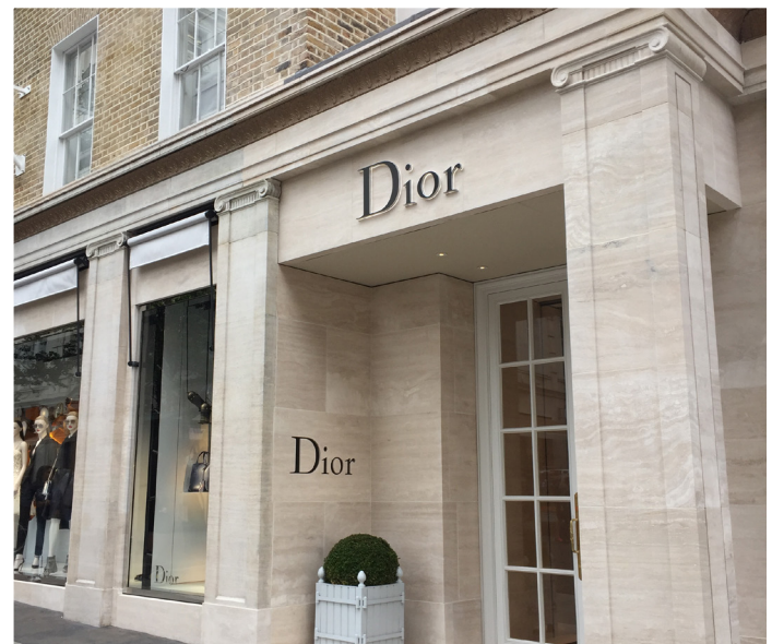
The Newton CDM System completely protects the store.