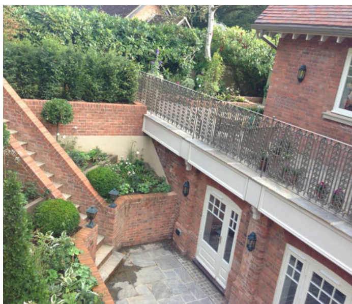
The finished terrace is completed protected from water ingress.