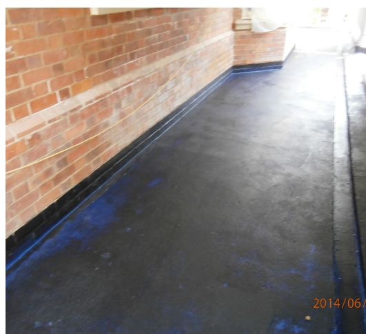
The podium deck primed with Newton NuSeal-LM.

The client was provided with a comprehensive and reliable waterproofing solution that was quickly and expertly installed by CCL.