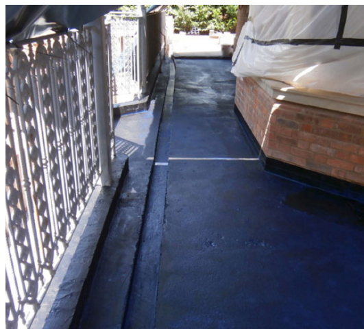
The deck waterproofing involved some intricate detailing.