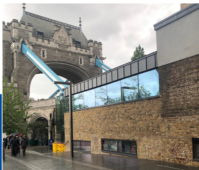
The Bridge Master's Quarters at No.1 Tower Bridge.