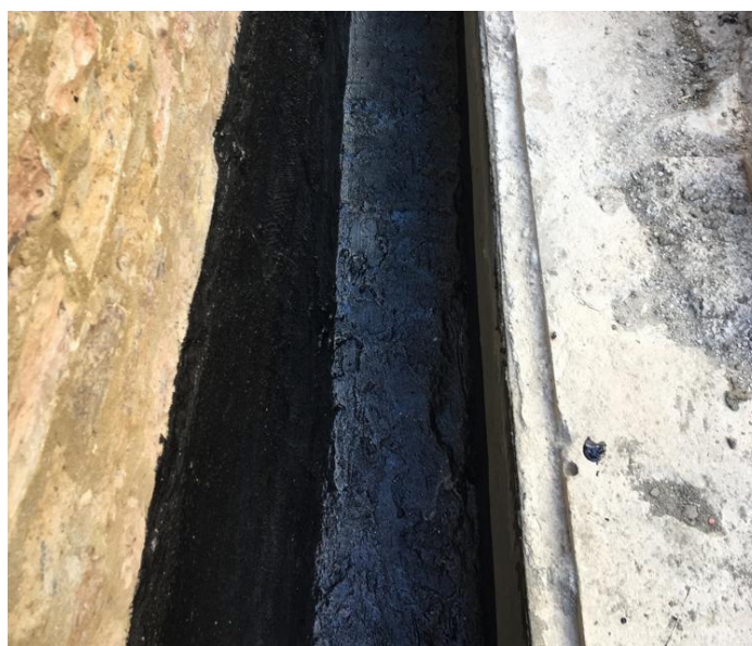
The external waterproofing also extended 1-metre below ground.