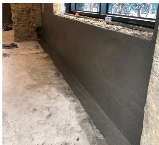
Pristine internal damp proofing by ASF Waterproofing.

Thanks to their meticulous attention to detail and high standard of installation, ASF Waterproofing were able to provide both the contractor and the client with a high quality and comprehensive damp proofing solution. As a result, the City of London Corporation can now hand over the building to the new lease holder, safe in the knowledge that it is well protected from damp.