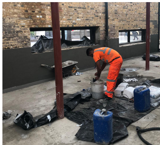
Using a spray machine to apply Newton 103-S.