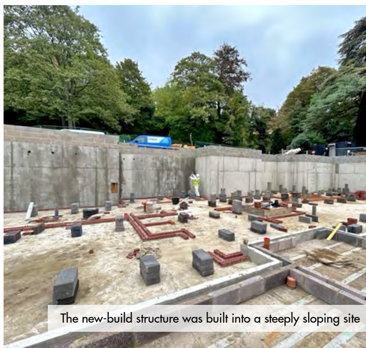
The new-build structure was built into a steeply sloping site

MacLennan's involvement began at pre-construction stage, collaborating with the design team and providing valuable insights on incorporating compliant waterproofing measures into the overall building design. This ensured that all parties were aligned on the best approach from the outset.