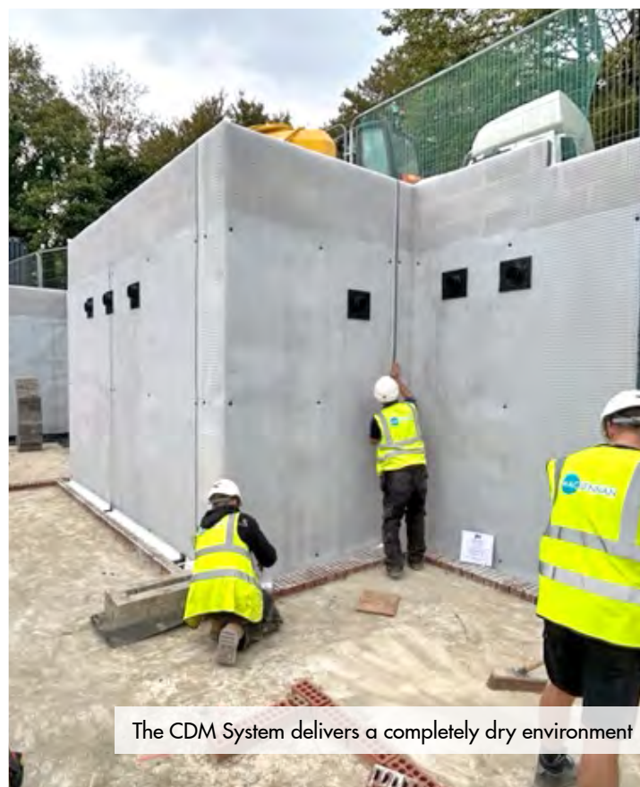
The CDM System delivers a completely dry environment