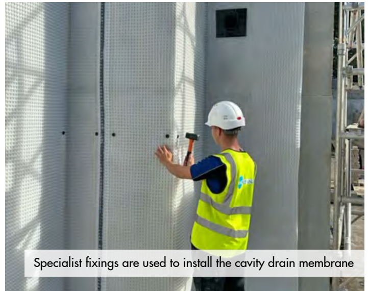
Specialist fixings are used to install the cavity drain membrane

MacLennan delivered a comprehensive and fully compliant waterproofing system within the project time frame and budget. The waterproofing of these luxury apartments was also assured by MacLennan's own installation guarantee, backed by comprehensive professional indemnity insurance, and demonstrating the quality and reliability of their installation.