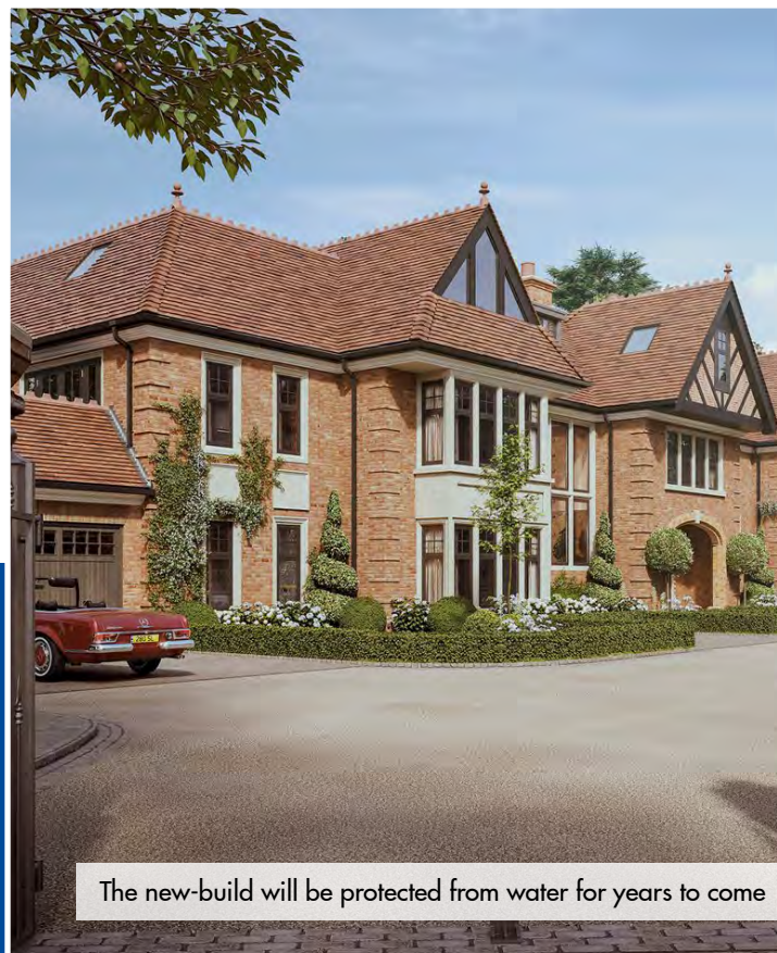
The new-build will be protected from water for years to come